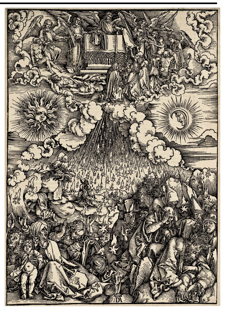
Albrecht Dürer — Opening of the 5th and 6th Seals (ca. 1496)

This is located just across from the bathrooms in the school basement.