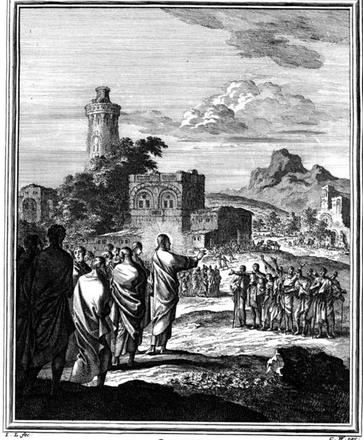
Liberat a lepra denos tua gratia, IESU: Vinus, qui grates fert tibi, mundus adeft. Vinus et est cujus tu tollis crimina mundus. Heu fcelus! ingratus fi foret ille tibi.

Blessing of religious objects takes place after Mass on the third Sunday of every month. Please leave your objects on the designated table in the school basement.