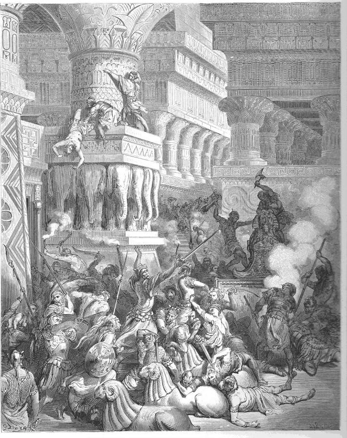
JONATHAN DESTROYING THE TEMPLE OF DAGON But Jonathan set fire on Azotus, and the cities round about it . . . and the temple of Dagon, with them that were fled into it, he burned with fire . . . (1 Maccabees 10: 84)

Blessing of religious objects takes place after Mass on the third Sunday of every month. Please leave your objects on the designated table in the school basement.